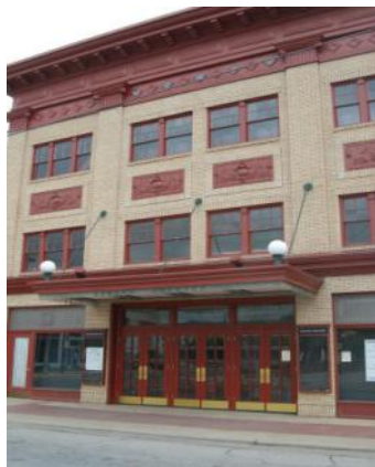
The Strand Theatre following the restoration of the original Marquee and Doors.